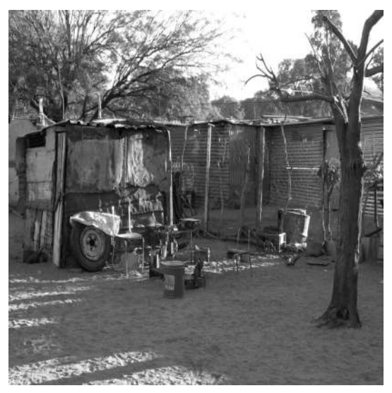
A slum area in Namibia

Some of the problems in slum areas and shanty towns